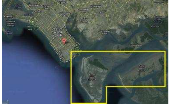
The project site

http://cdn.alquds.com/sites/default/files/styles/large/public/2013/6/27/47892134_545882_530175903691810_568718620_n.jpg